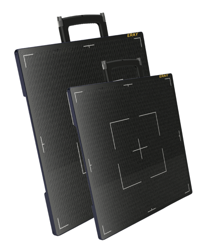
Premium Wireless Flat-Panel Detector